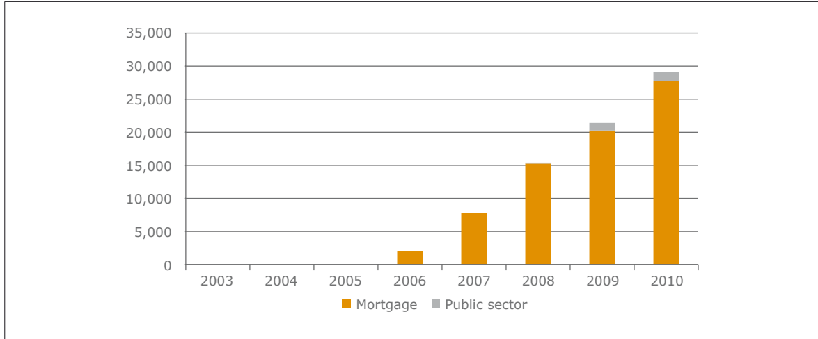
> FIGURE 1: COVERED BONDS OUTSTANDING, 2003-2010, EUR M